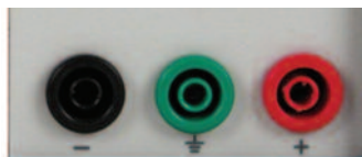
The 9120 series uses 4mm sheathed banana jacks that accept sheathed or shrouded banana plugs and meet the latest international safety standards.

Supplied: User manual, line cord, RS232 communication cable, Software Installation disk. Model 9123A also includes GPIB to TTL Serial Converter cable IT-E135 Optional: IT-E132 USB to TTL Serial Converter cable , IT-E151 rack mount kit.